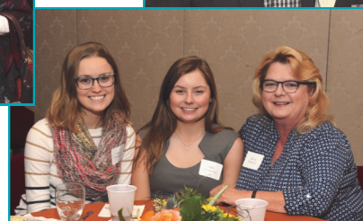
23rd Annual Donor Appreciation Reception November 8