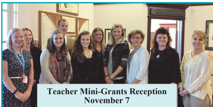
Teacher Mini-Grants Reception November 7