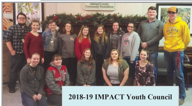
2018-19 IMPACT Youth Council