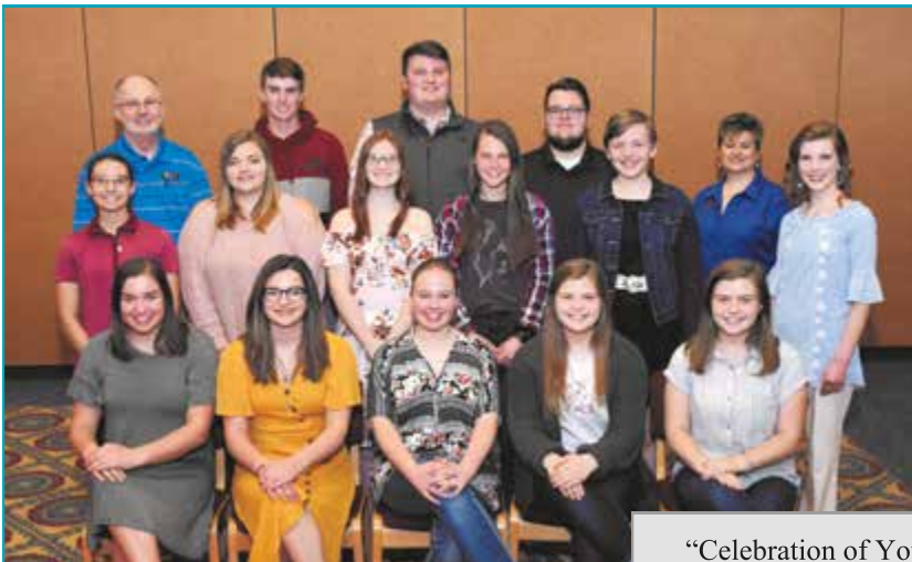
"Celebration of Youth Philanthropy" May 14