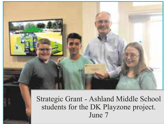
Strategic Grant - Ashland Middle School students for the DK Playzone project. June 7