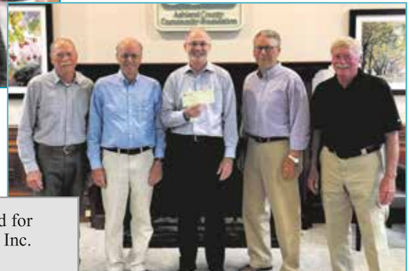
Legacy Fund Created for Ashland Implement, Inc. June 14