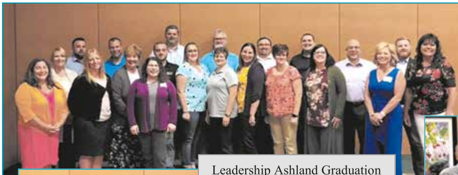
Leadership Ashland Graduation June 12