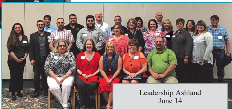
Leadership Ashland June 14