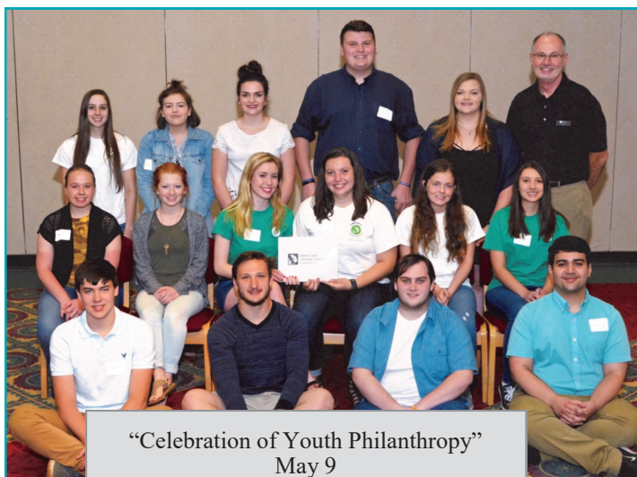
"Celebration of Youth Philanthropy" May 9