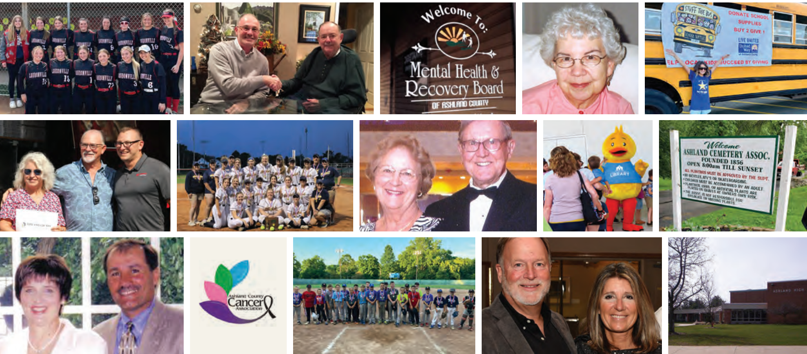
Barbara McCammon Memorial Fund